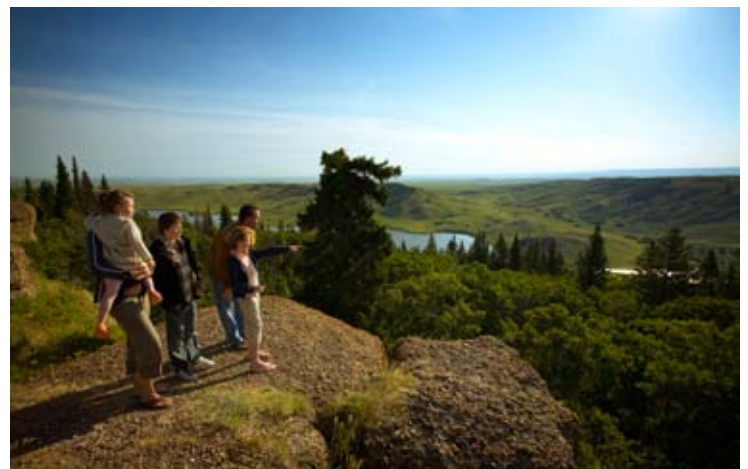
Cypress Hills Interprovincial Park.

To finish your route, return to Hwy 271 for the scenic 50 km drive to Maple Creek, which is just south of Trans Canada Hwy 1 and a much quicker route back to Regina. The Cypress Hills Vineyard & Winery is located just off Hwy 271 en-route to Maple Creek (watch for signs). If time allows, cap off your visit to Saskatchewan's southwest with a tasting of their wines made from Saskatchewan-grown fruits, a slice of saskatoon pie and a gourmet sandwich or artisan cheese platter.