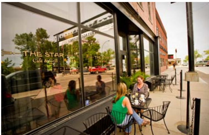
The Star Café & Grill, Maple Creek.

After savouring the country flavours of southwest Saskatchewan, we're sure you'll want to come back for seconds!