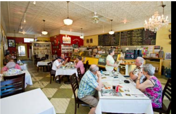
Café Paris, Gravelbourg.

From Cadillac, continue 92 km west on Hwy 13 to Eastend, home of the T. rex Discovery Centre. Since we're following our taste buds, our journey continues northwest toward Ravenscrag and the Spring Valley Ranch and Creamery, home of artisanal Chapel Cheese. From Eastend take Grid 614 north for 2 km and turn west onto Ravenscrag Road, following it for 20 km until you reach a T-intersection. At the intersection, turn right (bypassing Ravenscrag) and follow the grid up a long hill for 6.7 km, then turn left onto Davis Creek Road/Grid 706