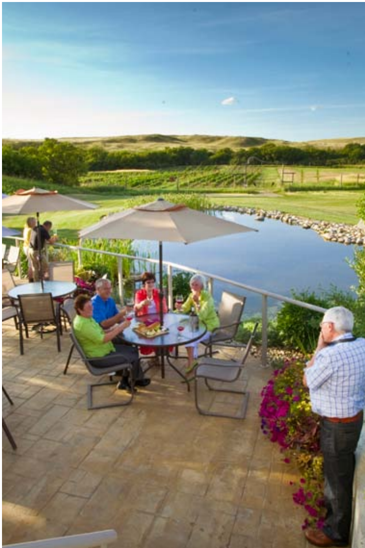
Cypress Hills Vineyard & Winery.

Finish day one in Maple Creek, often referred to by its “Old Cowtown” moniker. History and the present meet in this charming town with a vibrant legacy of ranching and rodeo. From Spring Valley Ranch, head west on Davis Creek Road/Grid 706 for 14 km, then travel north on Hwy 21 for 44 km to Maple Creek. This evening, dine in heritage elegance at THE STAR Café & Grill, enjoy some country cooking at the Rockin’ Horse Cookhouse, or savour an upscale meal at the elegantly restored Redmond House Bed & Breakfast and Dining Establishment. Maple Creek offers several fixed-roof accommodation options, full-service camping and a unique array of independently-owned shops.