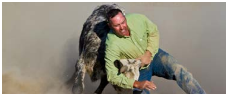
Wood Mountain Stampede.

This tour offers an authentic vacation experience that will bring you in contact with living legends, natural wonders and the adventurer within. Whether you're looking to live the life of a cowboy for a day, to explore the sweeping ranchlands by vehicle or to immerse yourself in history, this itinerary has something for everyone.